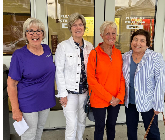
OCHS Scholarship Night, June 5

General Meeting 9/18/23 Board Meeting 10/2/23