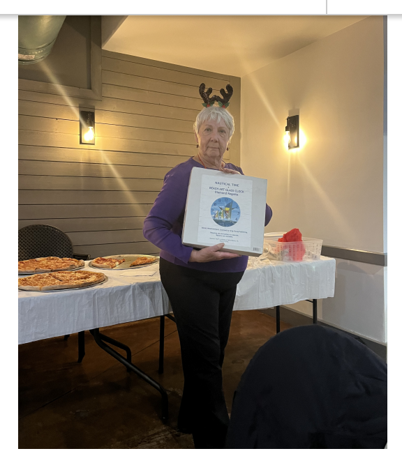
General Meeting 1/15/24 Board Meeting 2/5/24