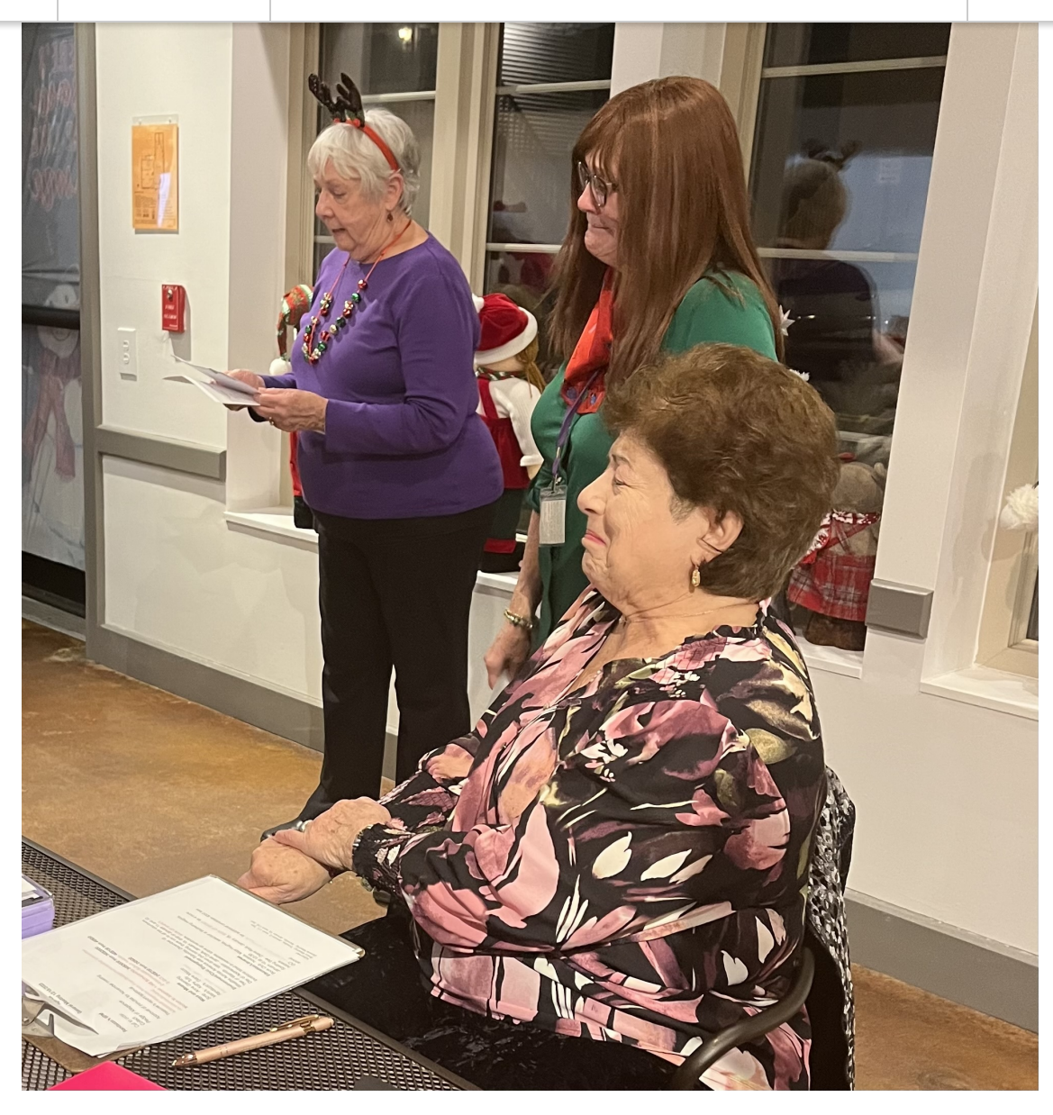
Something funny going on here!