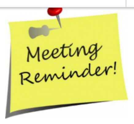
General Meeting and Day 0f Appreciation